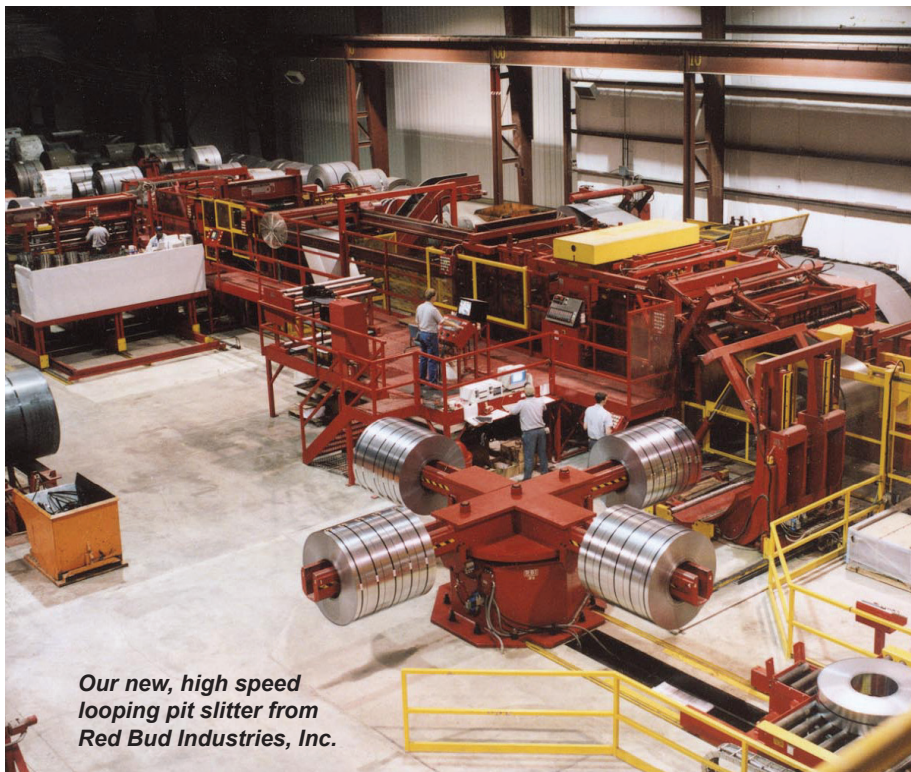
Our new, high speed looping pit slitter from Red Bud Industries, Inc.