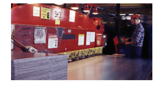
Call for a tour of our state-of-the-art facility to find out how The Dependability Difference can work for you!