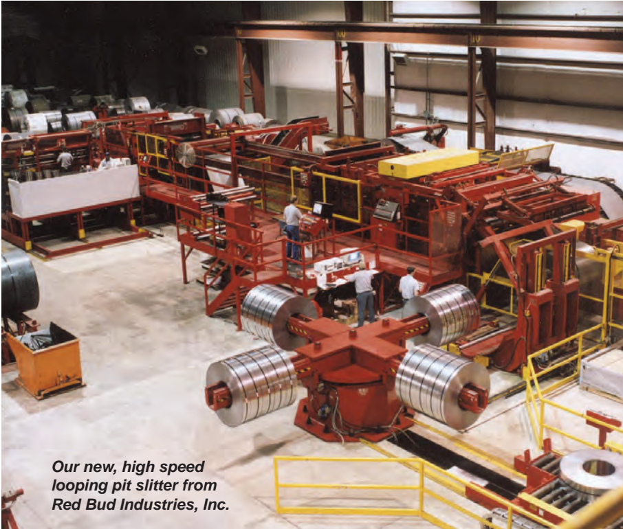
Our new, high speed looping pit slitter from Red Bud Industries, Inc.