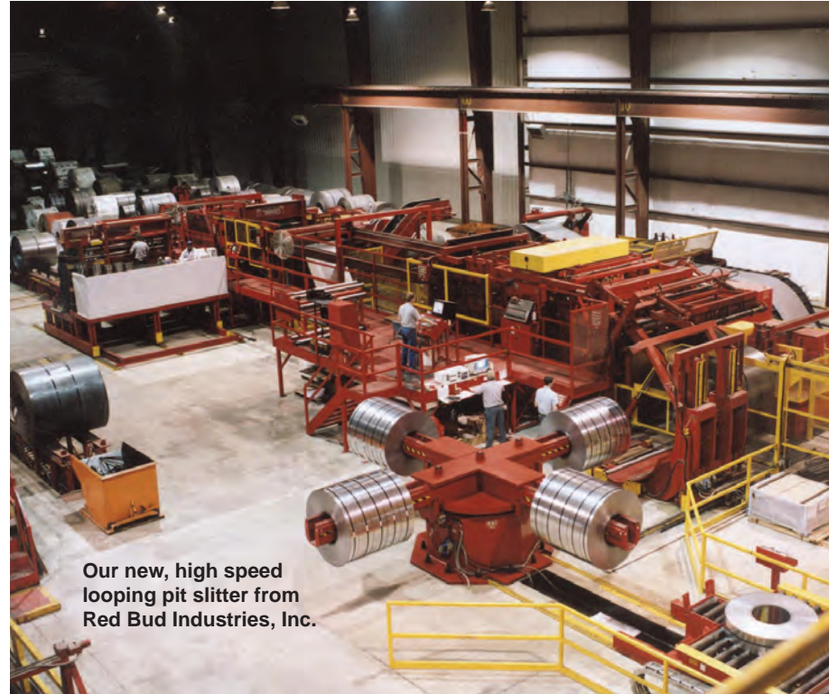
Our new, high speed looping pit slitter from Red Bud Industries, Inc.