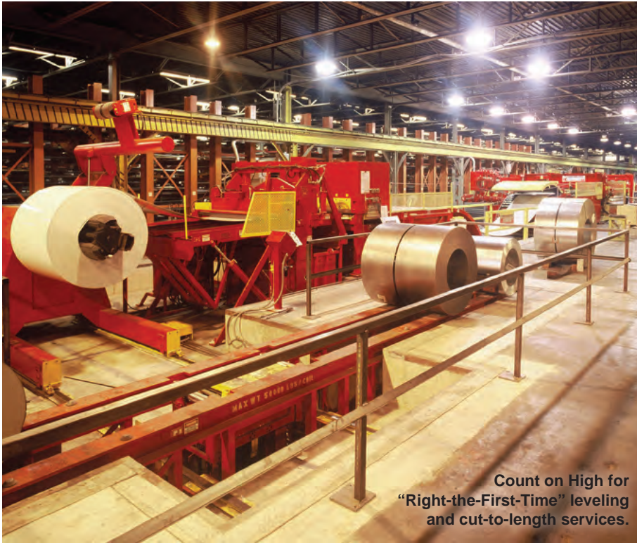
Count on High for "Right-the-First-Time" leveling and cut-to-length services.